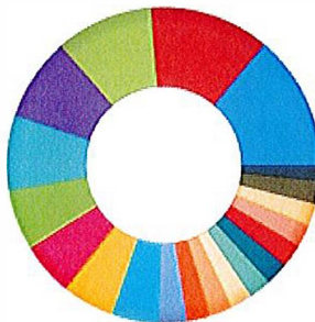
Top Roadway Collisions

LAGRANGE - 13.95% BALLARDSVILLE - 12.43% I71 S - 10.08% KY329 BYP - 9.527% US42 - 7.752% I71 N - 5.202% KY393 - 5.426% KY329 - 5.426% KY53 - 4.551% OLD SLIGO - 3.101% FLOYDSBURG - 2.326% MAYFIELD - 2.326% I71 S EXIT22 OFF RAMP TO KY53 - 2.326% COMMERCE - 2.326% I71 TURN AROUND22 - 2.326% SOUTH - 2.326% ORCHARD GRASS - 2.326% I71 S EXIT19 OFF RAMP TO KY393 - 2.326%